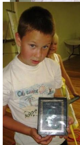
Rosemaled Photo Album each one did.