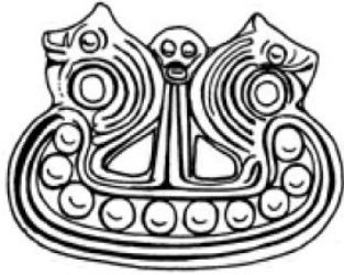
Vikings of Lake Lodge #6-166